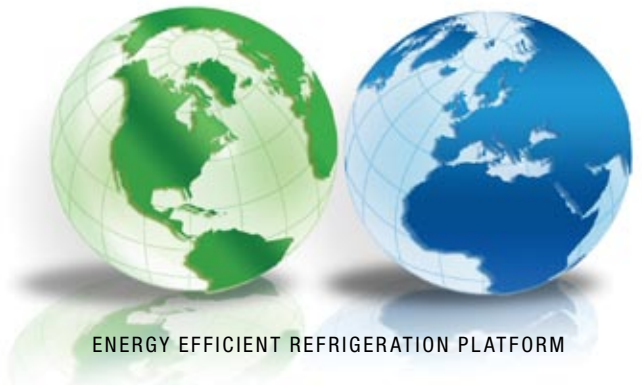
ENERGY EFFICIENT REFRIGERATION PLATFORM

...is two times more energy efficient than machines made five years ago. 40% more energy efficient than competitors.